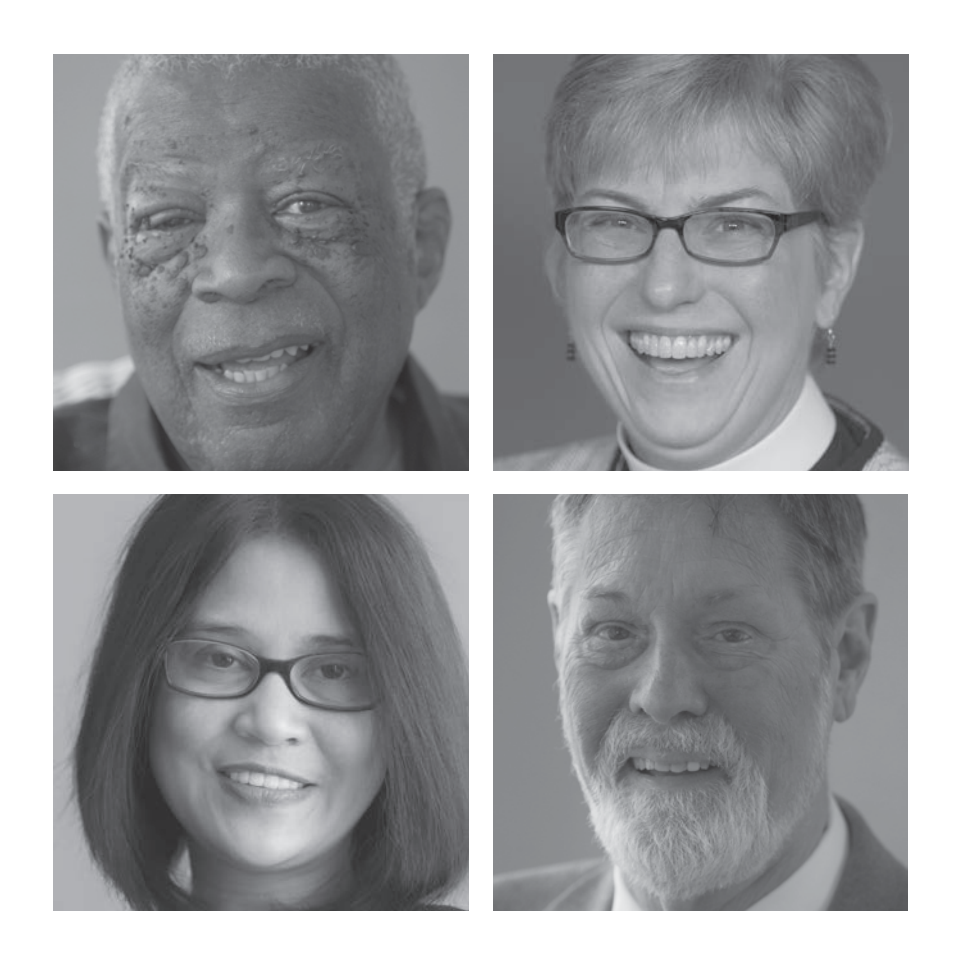
Advocates For Your Well-being