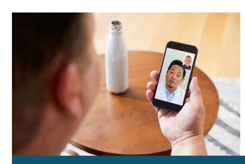
Treatment from your care team Get help overcoming pain and discomfort, recovering from an injury, and more!

Follow along in the app for simple, 10-minute exercise therapy sessions.